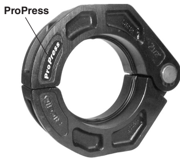
ProPress XL Press Ring (No Strap, Needs Strap Retrofit)