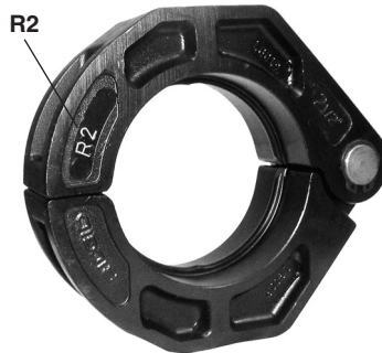
R2 Press Ring (No Strap, Needs Strap Retrofit)